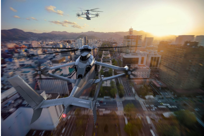
Picture 1 The sustainably produced helicopter is designed to travel at speeds of over 400 kilometers per hour.