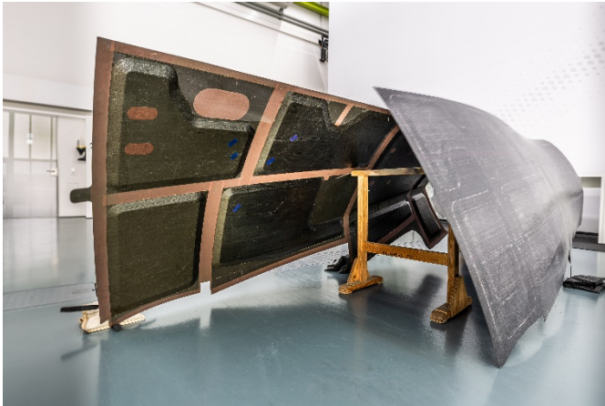
Picture 3 The cured side shells, ready for installation in the RACER helicopter prototype.