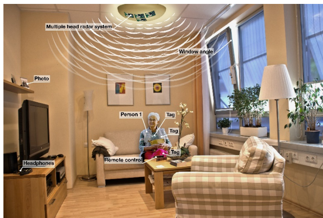
Fig. 1 The passive tags can be unobtrusively integrated into everyday objects such as items of clothing. Radar modules on the ceiling detect the position and the movement of the tags.

A first prototype of the system for the care sector is expected to be ready by winter 2021.