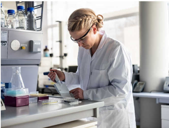
Fig. 2 Determination of the enzymatic activity of a biofunctionalized plastic.