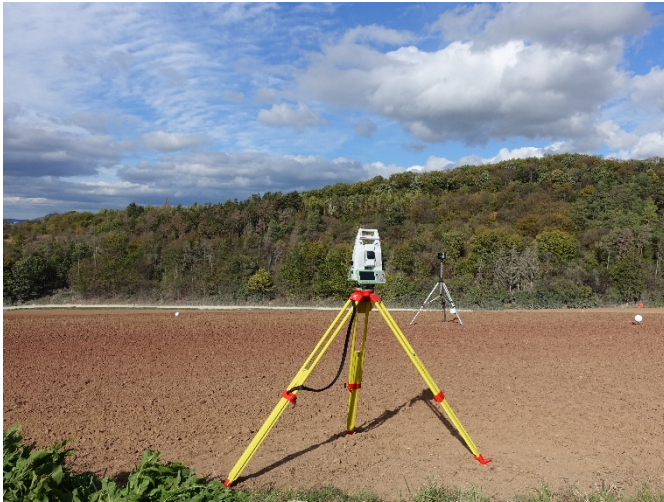
Picture 1 Digitization of the experimental field, with the measuring equipment in the foreground.