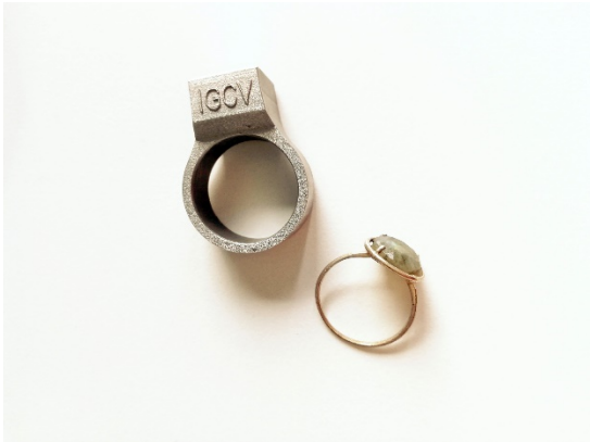
Picture 1 The smart ring with integrated electronics is only slightly bigger than a normal finger ring.