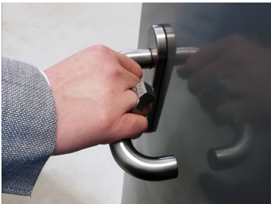
Picture 2 Thanks to the integrated RFID tag, the ring produced by the 3D printing process can act as a door opener.