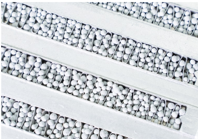
Picture 3 Heat exchanger with metallized zeolite.