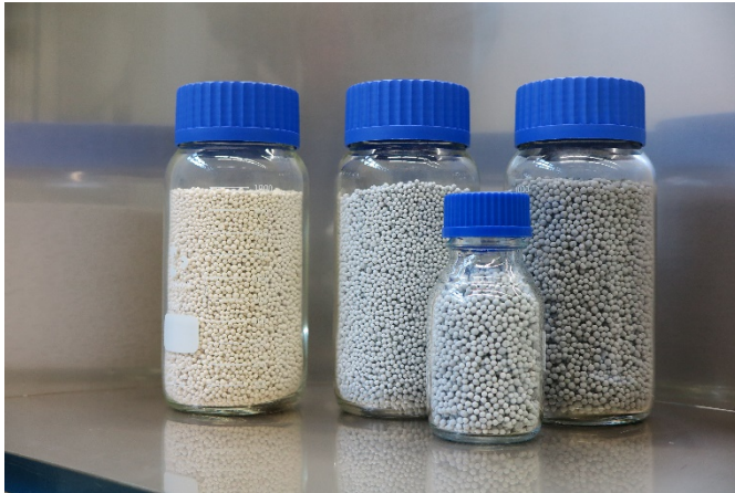
Picture 2 Zeolite granules in their original state (left) and coated with aluminum.