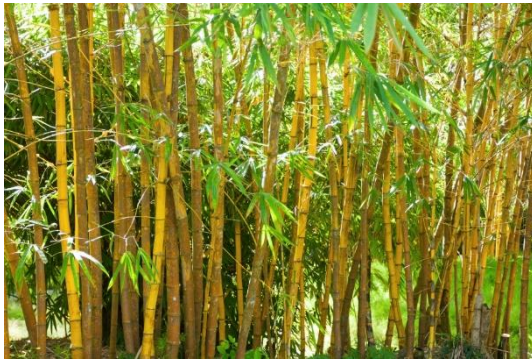
Fig. 1 Ideal for use in building construction: Bamboo is a high-quality substitute for wood and can also be used in a very similar way.