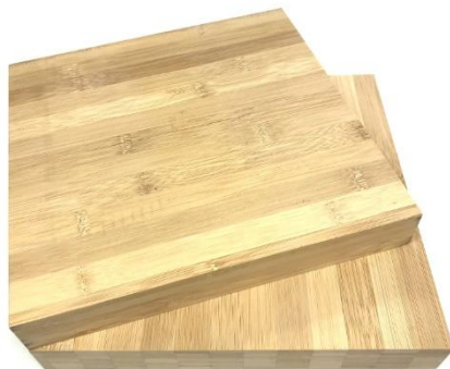
Fig. 3 In a similar way to wood, bamboo can be used to manufacture sturdy panels.