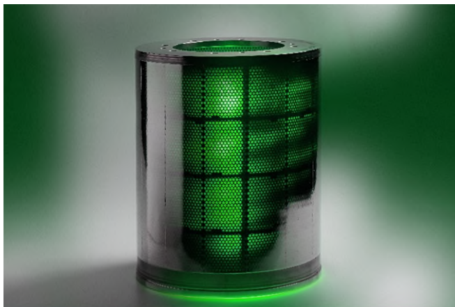
Figure 1: 59 million holes in the filter plate of the first laser-drilled filter for the filtration of microplastics from municipal wastewater.