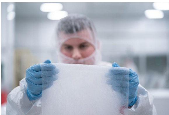
Fig. 1 The nonwovens used for FFP-2 masks must filter at least 94 percent of aerosols, particles or viruses according to DIN.