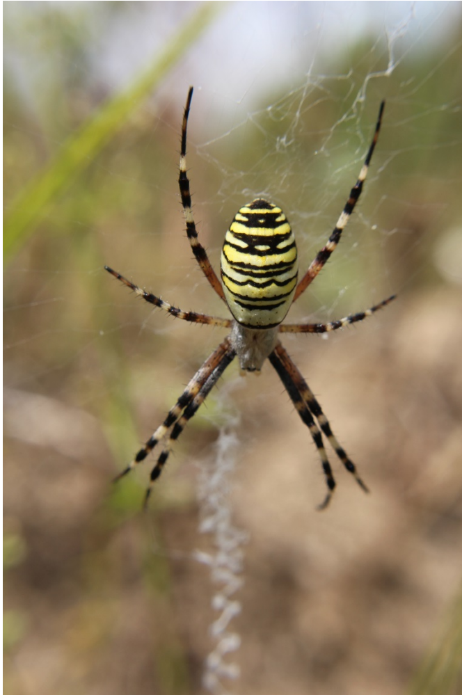
Picture 2 The venom cocktail of the wasp spider has only recently been deciphered.