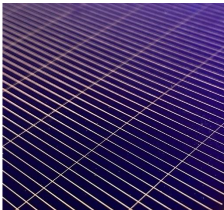
Fig. 1 At just 19 micrometers in width, the copper contacts are extremely thin. As a result, the light-sensitive silicon layer does not experience much shading.