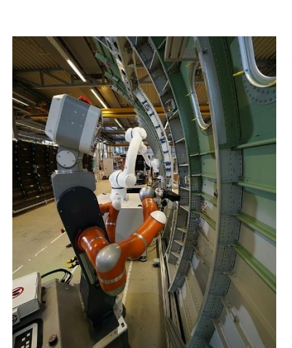
Fig. 3 The SWAP-IT architecture can be used in many different sectors, such as aircraft construction. Fraunhofer researchers will be presenting a series of practical demos at the Hannover Messe.