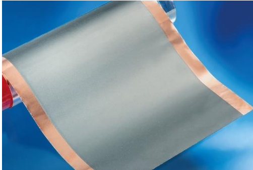
Fig. 2 Electrode layer applied to copper foil and dried with laser technology: Researchers at Fraunhofer ILT have halved the energy required for drying in the production of lithium-ion batteries.