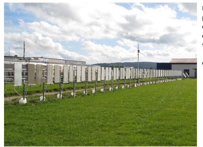
Fig. 1 Facade plaster samples were exposed to the elements for 18 months. After each rainfall, they were tested in the laboratory.

As a next step, Fraunhofer researchers want to refine the model to calculate the transformation products that arise from biocides as a result of environmental influences and to transfer the model for use with other materials. For example, it has been known for quite some time that root penetration inhibitors used to protect roofing membranes from root penetration in flat roofs with bituminous sheeting leach out and can filter into the environment through water runoff.