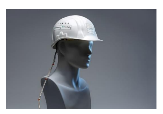
Figure 1: The piezo-electret transducer is inconspicuously integrated in the inner fastening strap of the helmet. The photo shows a demonstration model of the technology.