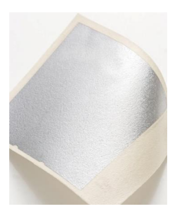
Figure 2: The piezo-electret film is foamed and coated with aluminum as a contact layer by means of vapor deposition. When it is deformed by acceleration forces exerted on it, it emits voltage that is recorded by the system as a signal.