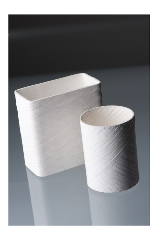
Fig. 3 Pipes made of the oxide-ceramic composite-fiber material O-CMC

RESEARCH NEWS February 1, 2024 || Page 5 | 5