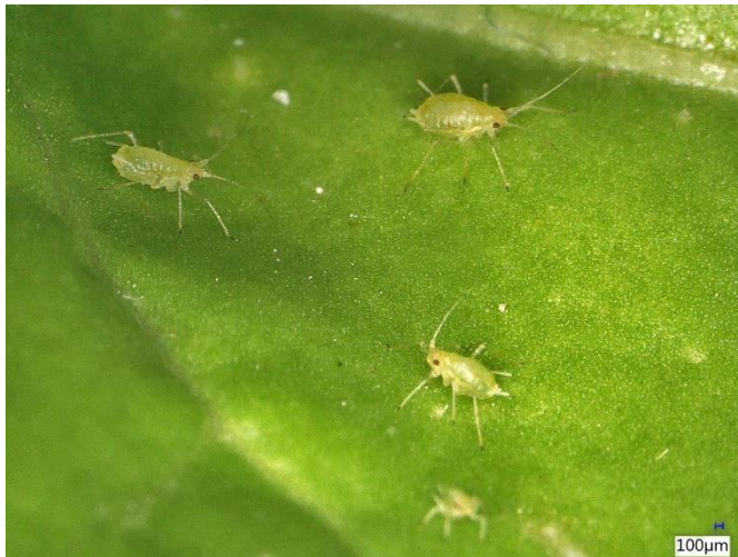
Fig. 1 Green peach aphids carry various yellowing viruses that lead to high losses in sugar beet yields.