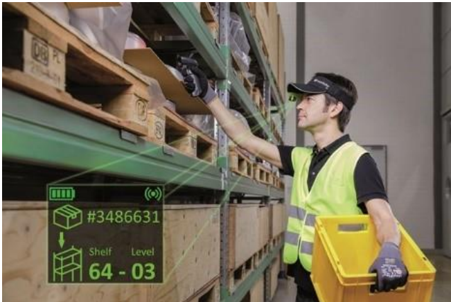
Fig. 1 The Fraunhofer FEP Microdisplays and Sensors business unit, which will be integrated into Fraunhofer IPMS, develops OLED and \mu LED displays.