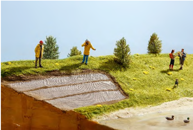
Fig. 1 The Fraunhofer institutes attach particular importance to the practical relevance of their new developments. This example shows the use of geosynthetics in riverbank stabilization.