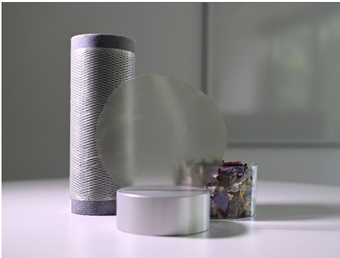
Fig. 2 Fibers and films made from recycled polypropylene from packaging waste